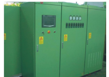
电气柜 Electric panel