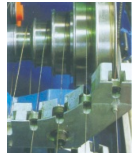
主机 Drawing machine